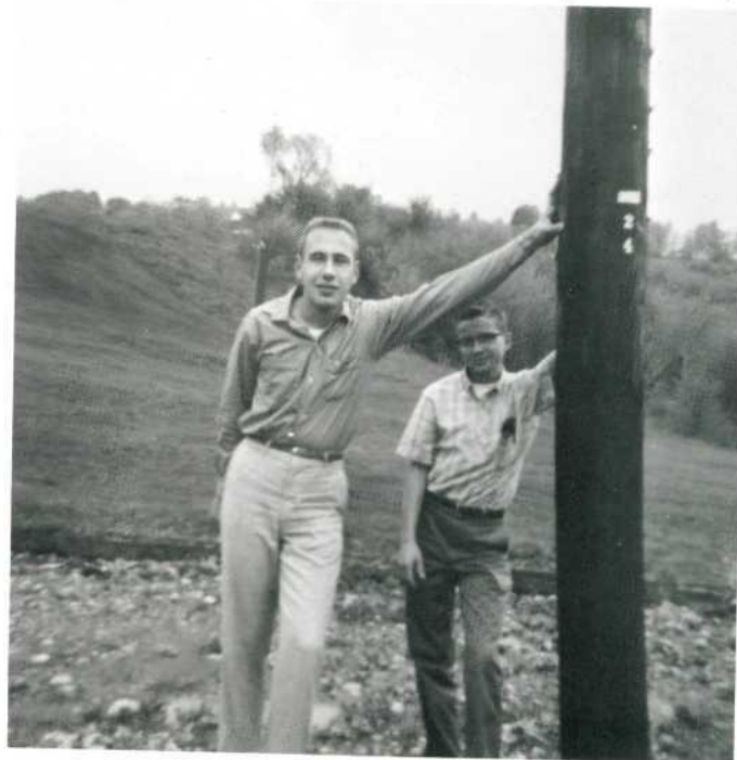
Well, SOMEBODY'S got to hold this pole up!