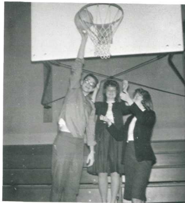
It's easy when you know how to do it.