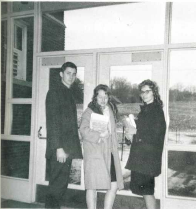
The end of a long hard day.