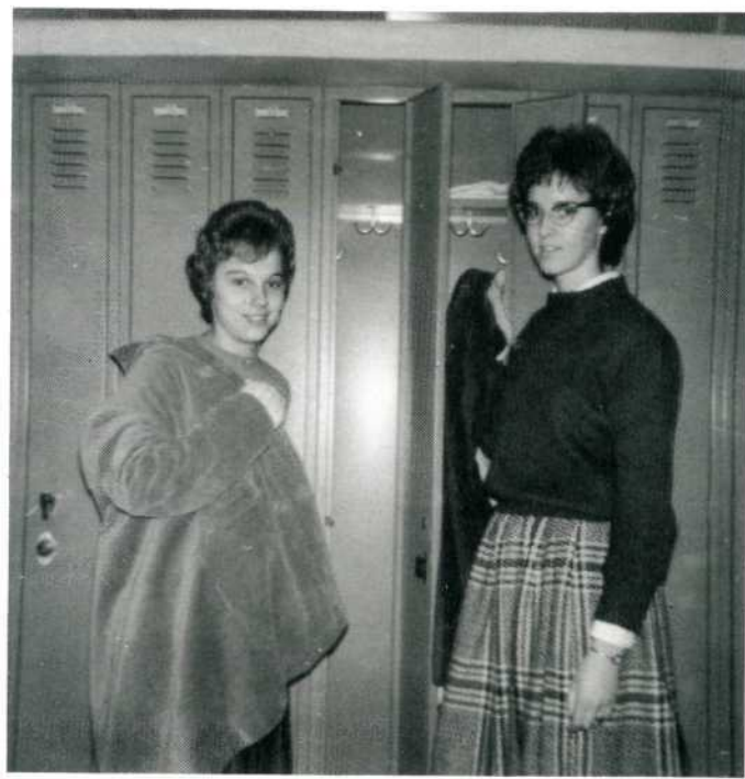
Smile; you're on Candid Camera.