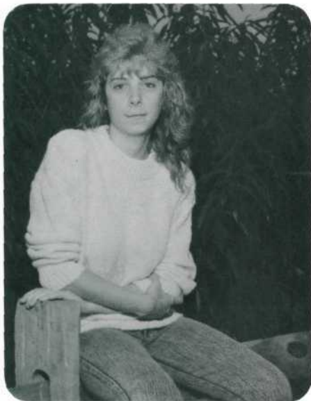
"Friends are forever."