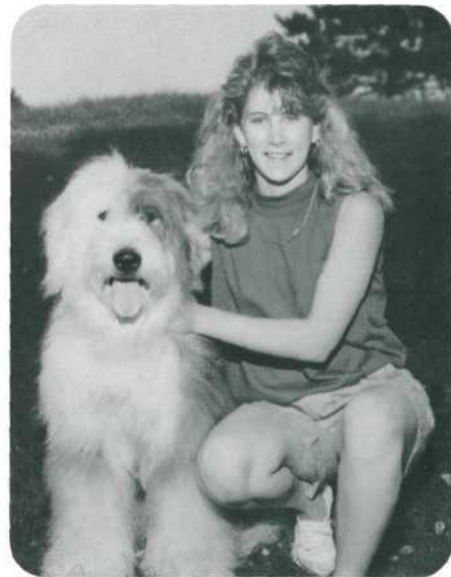
"There's nothing certain in this world except death and taxes and the ringing of the telephone when you're taking a bath."

Class Sec. 9-12; Var. Soccer 7-12, Co-captain 11-12; J.V. Basketball 9, Co- captain; Var. Basketball 10-12; Var. Softball 11-12; Lang. Club 9-10; Sr. High Band 9-12, Treas. 12; YAC 12, Treas. 12; Business Club, Yearbook.