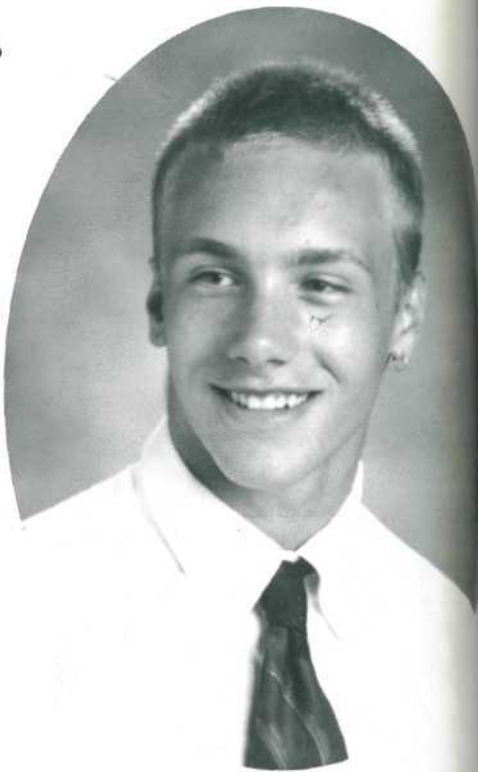
"It Can't Rain All Of The Time"-The Crow "There are m so pick one an