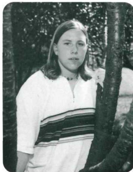
Soccer 10-12, FBLA 11, Language Club 8-11, National Honor society 9-12, Yearbook 12, Choir 7-12