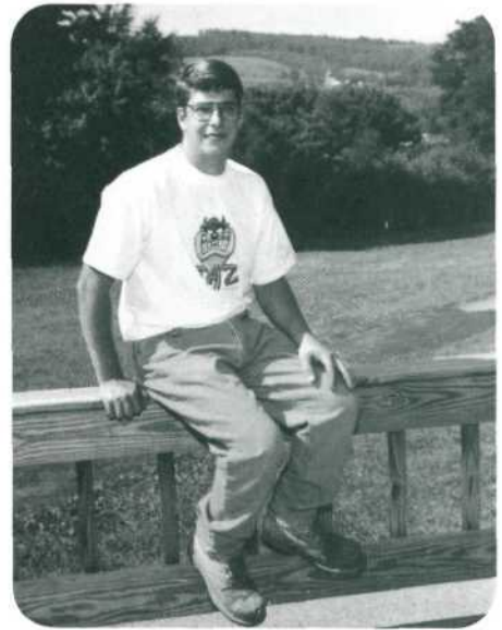
Future Farmers of America.