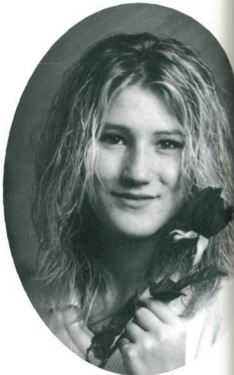
Always remember, never forget, learn to for "You have to s but never regret for anything."