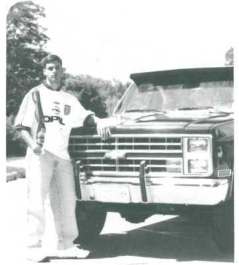
9-10 FFA, JV Basketball 9-10, Varsity soccer 11, Varsity Basketball 11-12, 9 Vice President