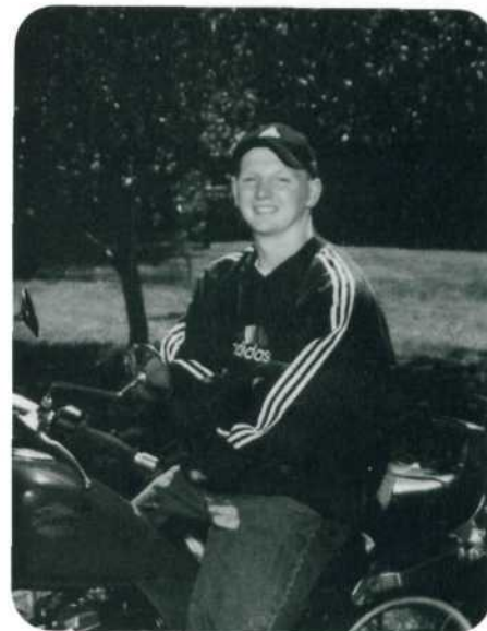
Jv. basketball 9th, Varsity basketball 10-12, Varsity soccer 9-12, Varsity baseball 9-12.