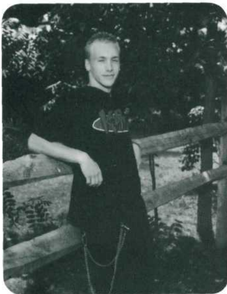
11 + 12 Varsity Soccer, Yearbook, 9-12 Honor Society, 12 FBLA, Class VP 10-12, Language Club 9, Tech Club